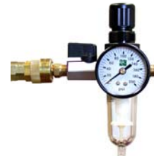
Air Filter, Regulator, Gauge Pkg. 1559A-ASSY