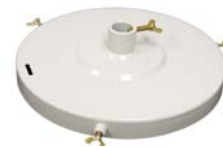
Drum Cover 65385