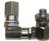
"Z" Swivel 1545